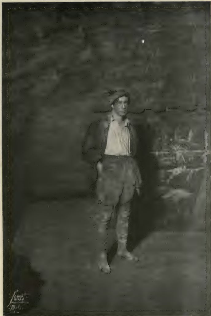
Photograph by Sweet